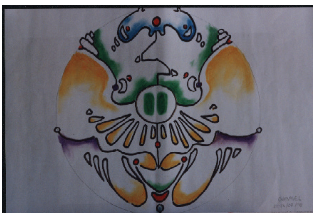
Figure 5. This drawing indicates a shamanic type of transpersonal resolution.

These new states involve the entire system (Prigogine & Stengers, 1988). In some of their statements, Prigogine and Stengers (1975, 1979, 1984) declared that