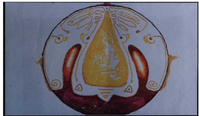
Figure 6. This drawing expresses a gynaecium , which indicates new openings.